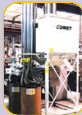
Inside Surge Bins