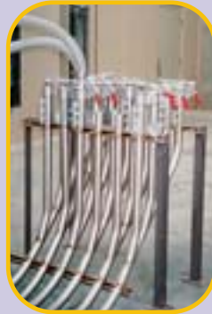
Manifold with 2" Quick Disconnect