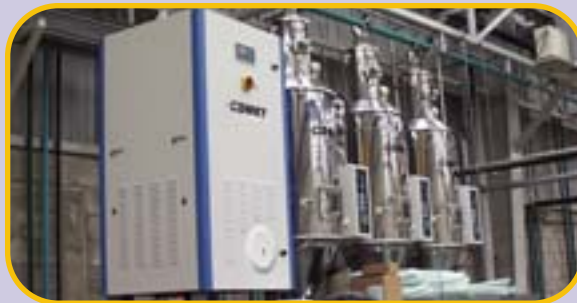
Centralized Honeycomb Drying System