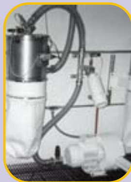
Vacuum Pumps and Central Filters