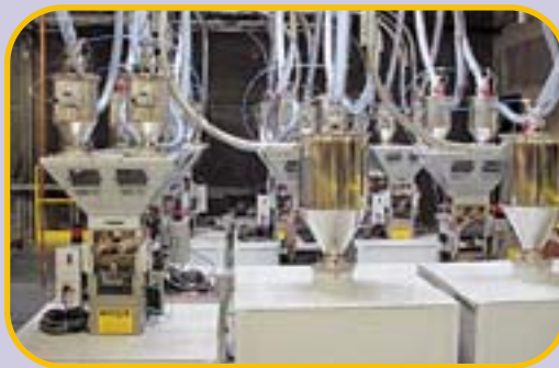
Central Weigh Blending