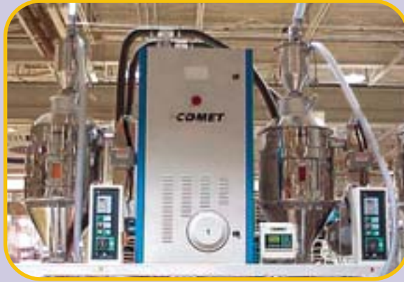
Honeycomb Dryer with 2 Drying Hoppers