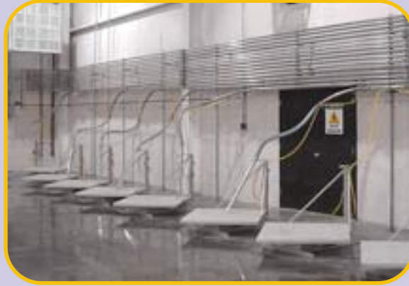
Tilt Tables & Piping