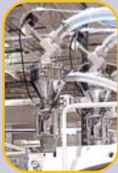
JIT Glass Loaders