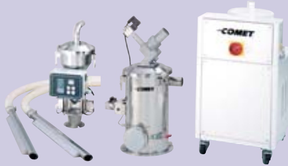
M-Pump with SV3 & S6

M-Pump vacuum units are portable and feature a powerful 3-phase vacuum blower, cartridge filter, and exhaust manifold. The unit is capable of connecting to one S-Series filterless receiver or as many as six S-C Series receivers.